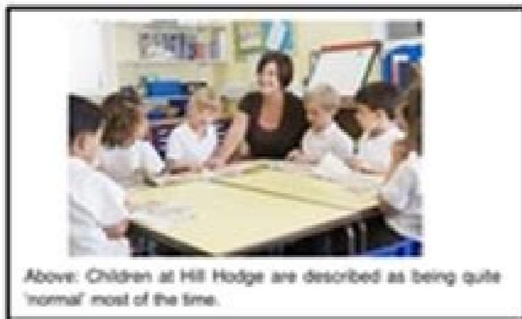
Above: Children at Hill Hodge are described as being quite 'normal' most of the time.

happenings. However, it can be confirmed that similar events were witnessed across the country, including one case in Northern Ireland.